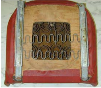
669347-Spring housing type B18 (alt.2 ) (Duett ??)