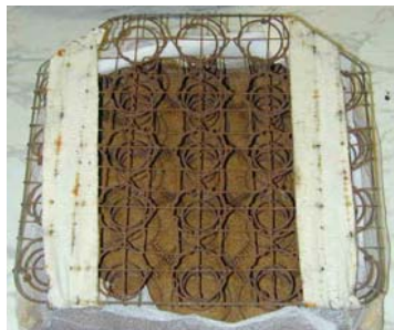
666793-Spring housing type B 18 ( alt.1 )