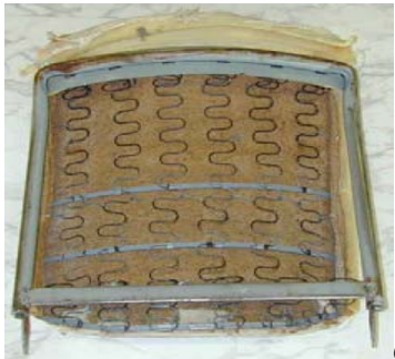
690369-Upholstery type B 18