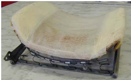
690369-Upholstery type B 18